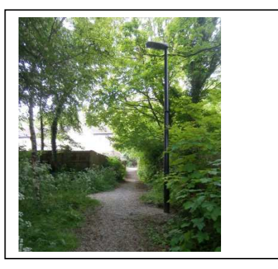
Looking towards Pine Road